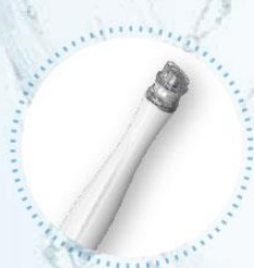
① Aqua Cleansing

AquaClean mini consist of 3-in-1 system that combines three different technologies including the aqua clean system using vacuum , electroporation and double lifting . 3-in-1 system provides all facial care including cleansing, solution penetration and lifting to a single device.