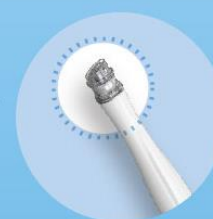
④ Diamond Peel

AquaClean Mini has the option to add another facial care that is suitable for medical skin clinics and hospital centers, making it a 4-in-1 system that combines aqua clean system using vacuum, electroporation, double lifting and diamond peel.