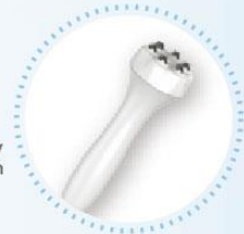
② Multi-polarity Electroporation