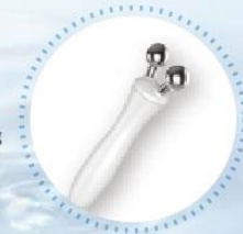
③ Double Lifting